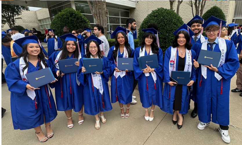
Singley Collegiate Class of 2024 (1 st Graduating Class)